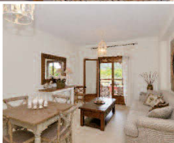
1 Bedroom apartment